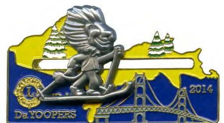
2014 Yellow Sliding Pewter Lion

NOTE: The blue, green, and red sliding Lions for 2014 are the regular issues and the purple, white, and yellow are special issues.