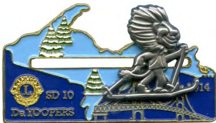
2014 Blue Sliding Pewter Lion

NOTE: The red, green, and blue sliding sleds with the Lion for 2013 are the regular issues and the purple, lime, and gray are special issues.