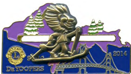
2014 Purple Sliding Old Gold Lion