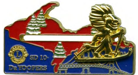
2014 Red Sliding Bright Gold Lion